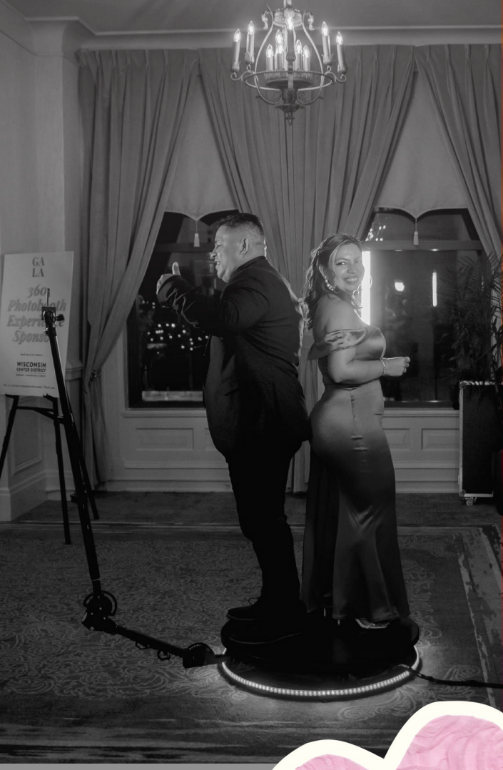
Photo Experience Sponsor